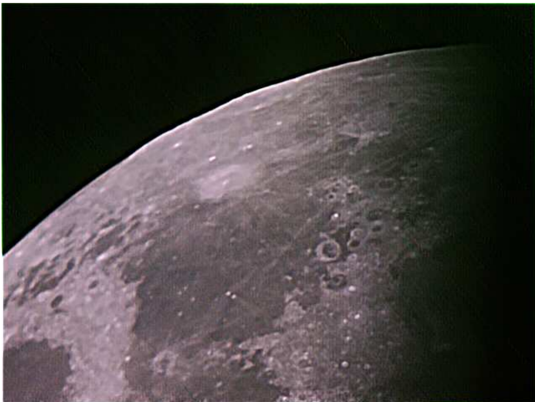
(taken on 18.03.2011: the day before Super Moon)